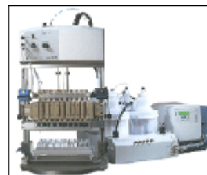
QUEST 210 ASW